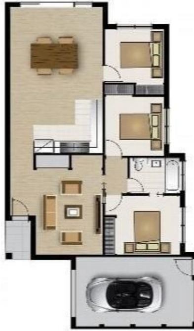
Dwelling 3 First Floor Plan